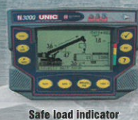
Safe load indicator