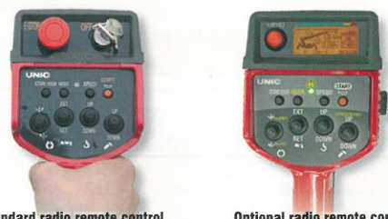
Standard radio remote control